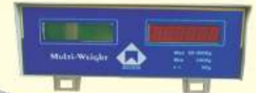
INTELLIGENT TERMINAL (I.T.) SUITABLE FOR DUSTY ENVIRONMENT