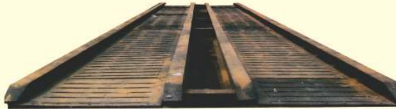
MOBILE STEEL STRUCTURE WEIGHBRIDGE