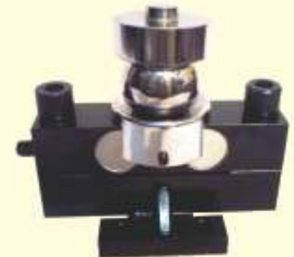
DOUBLE ENDED DIGITAL LOAD CELL

MAINTENANCE FREE CONCRETE TRUCK/TRAILER SCALES SOLID AS ROCK